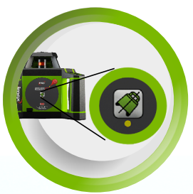
Bump-Stop mode For use in busy work site areas to prevent re-levelling errors

Self Levelling Horizontal Plane Self levelling 400m dia range